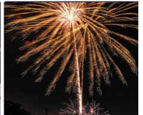
Check out the 90th Highlight Reel here: https://www.youtube.com/watch?v=0tGjcjWfJI8&t=89s